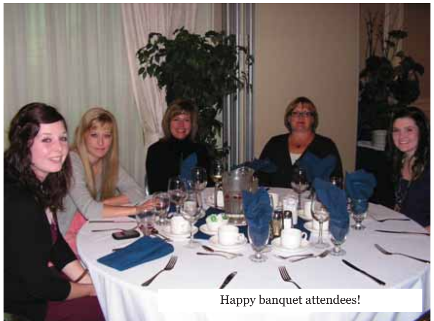
Happy banquet attendees!